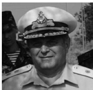
Ihor Tenyukh , member of neo-Nazi Svoboda party, now Minister of Defence.