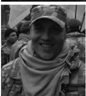
Andriy Parubiy , co-founder of the fascist Social National Party, which later changed its name to Svoboda. He is the new top commander of the National Defence and Security Council.