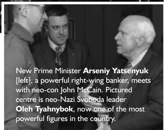
New Prime Minister Arseniy Yatsenyuk [left], a powerful right-wing banker, meets with neo-con John McCain. Pictured centre is neo-Nazi Svoboda leader Oleh Tyahnybok , now one of the most powerful figures in the country.