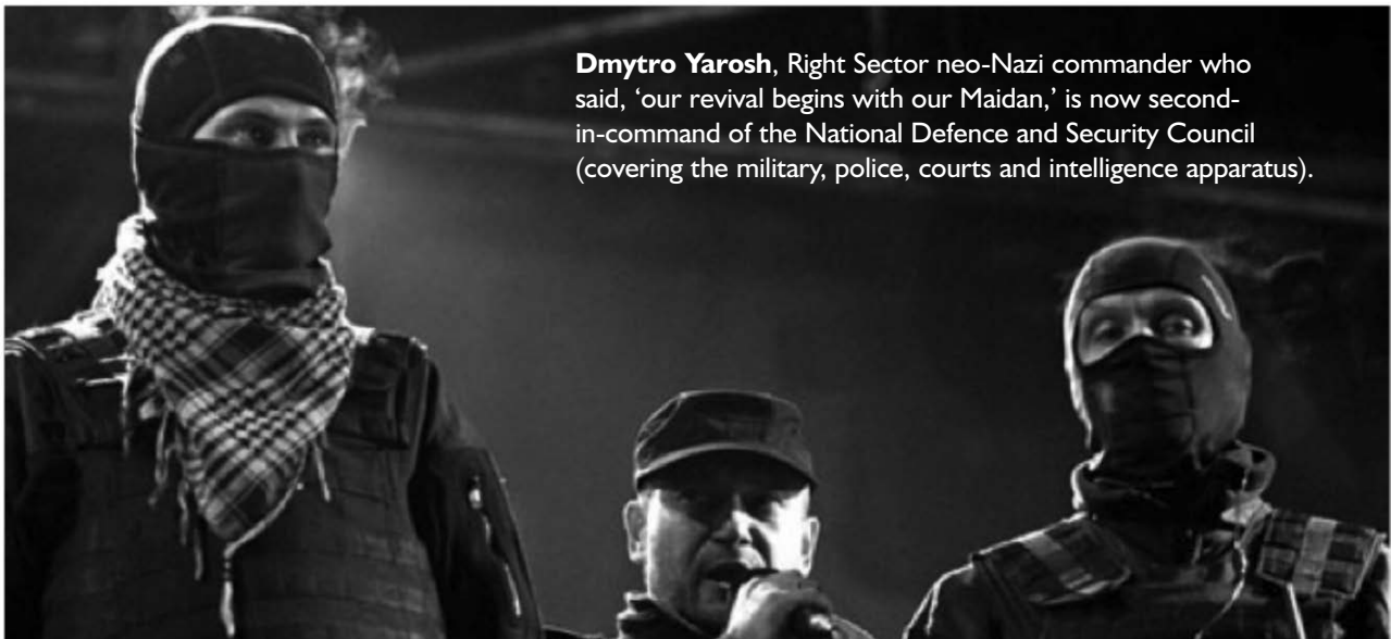
Dmytro Yarosh , Right Sector neo-Nazi commander who said, 'our revival begins with our Maidan,' is now second-in-command of the National Defence and Security Council (covering the military, police, courts and intelligence apparatus).

Nothing could be further from the truth. The new, self-appointed government in Kiev is a coalition between right wing and outright fascist forces, and the line between the two is often difficult to discern. Moreover, it is the fascist forces, particularly the Svoboda party and the Right Sector, who are in the ascendancy, as evidenced by the fact that they have been given key government positions in charge of the military and other core elements of the state apparatus.